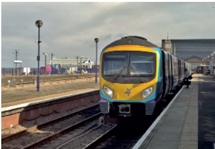
At Cleethorpes Station

Between Monday and Friday we usually see two people issuing tickets until 10.00, but the ticket machine is still unreliable and may be replaced by the end of the year. Incidentally, there is free wi-fi at the station. It's possible to sit in the shelter and order tickets online and they'll usually be available to collect by the time you've walked to the machine – when it works, of course!