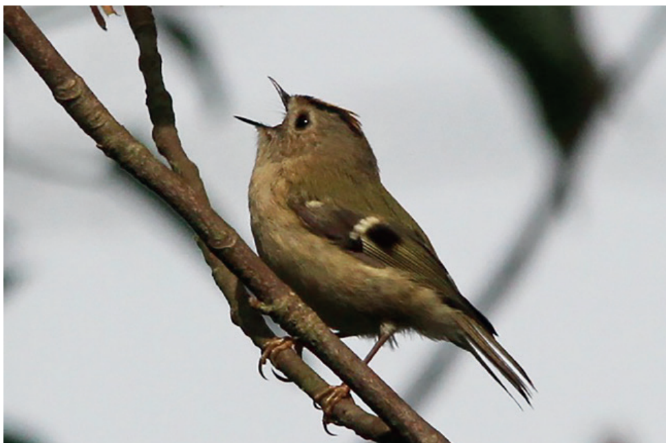
Goldcrest singing

As we stepped inside the wood a variety of common woodland birds were heard singing but suddenly everyone stopped and stared as a wonderful Jay flew into a tree next to us! You almost felt you could touch it! And then another one appeared close by. You didn't need binoculars to appreciate this member of the Crow family with its pinkish-buff body colour, the blue and black in the wings and, when it moved, the white rump. No raucous call this time, just great views.