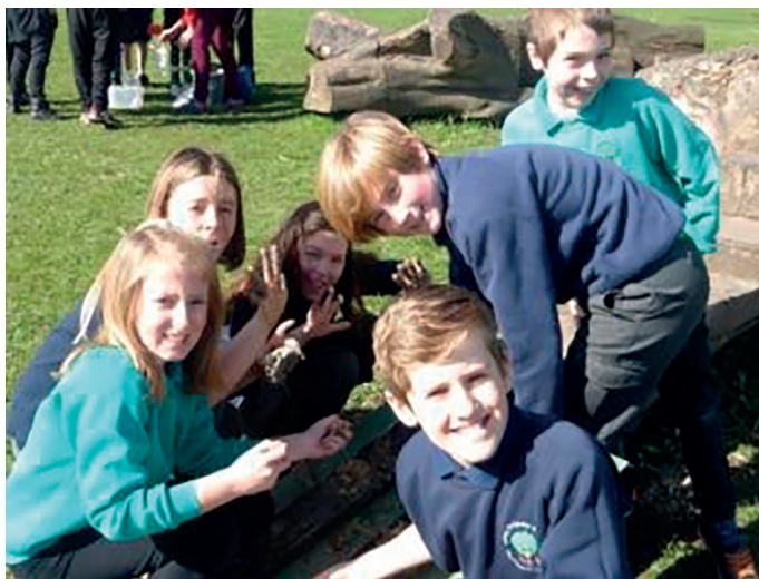
Y5 pupils enjoying a Moorland Discovery Workshop

into on a regular basis and play a vital role in developing children's identities and sense of belonging within their local area. There are many recent examples of these valuable community connections which have enriched children's experiences of school. A visit from the lovely Ann and Carys from Totley Library to commemorate World Book Day was a real treat, for instance, with each class enjoying some extra special story time. All it took for our Y1 children to be inspired at the start of their topics on plants was a Spring flower walk around the local area. The children were amazed at the col-