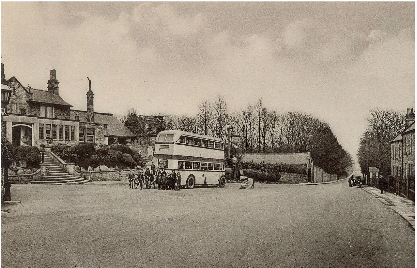
The Cross Scythes, Baslow Road, in the 1940s - or was it the 1950s? Note the Police Call Box on the right.