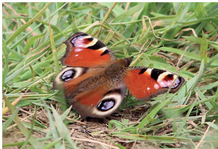
Peacock Butterfly

Time was getting on, so once again we had to drag ourselves away and head on to our start point. Needless to say we still had plenty more opportunities to see Great Spotted Woodpecker as we heard their calls and more drumming. However it was only when we were coming to the end of the walk that we were alerted to a number of short sharp "kick" calls and then we managed to see two birds, almost certainly a pair, as they flew out into the open from the edge of the wood. White, black and red flashed before us, as both birds shot across the corner of the field. Someone mentioned they had not realised just how quickly Woodpeckers can fly, especially when in a downward trajectory.