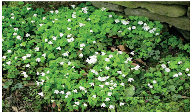
Wood Sorrel spreading naturally under an Alder tree

In early April, the Hawthorn trees and hedges suddenly become that lovely fresh green colour. I now have four trees and they support more wildlife than all other trees in this country, apart from our English Oak. I have a very old Midland Hawthorn which was planted before we lived here, which has deep pink blossom, but all the others are the native white blossom variety.