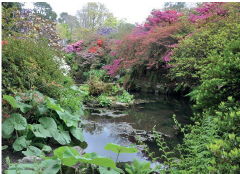
Bodnant Gardens, North Wales

To help rhubarb build up new crowns for next year, stop picking. Any flower shoots that appear should be removed and the plants should be well watered and fed. They would also