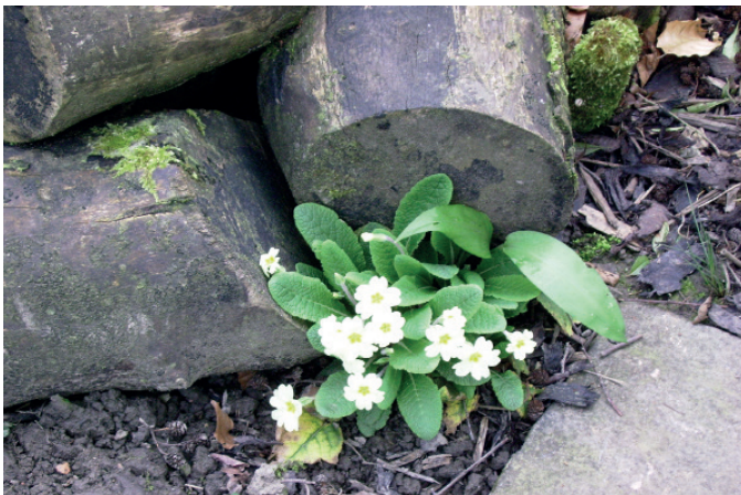
Wild Primrose goes it alone and finds a home at the edge of a path under a log pile