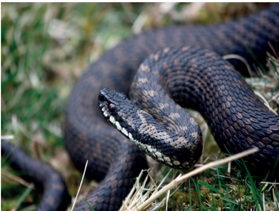
Male adder on the Eastern Moors

400 local adders are another good reason to obey the law by