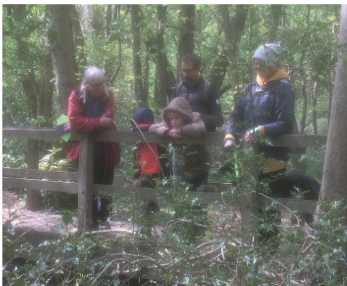
Closing our eyes and listening on the bridge