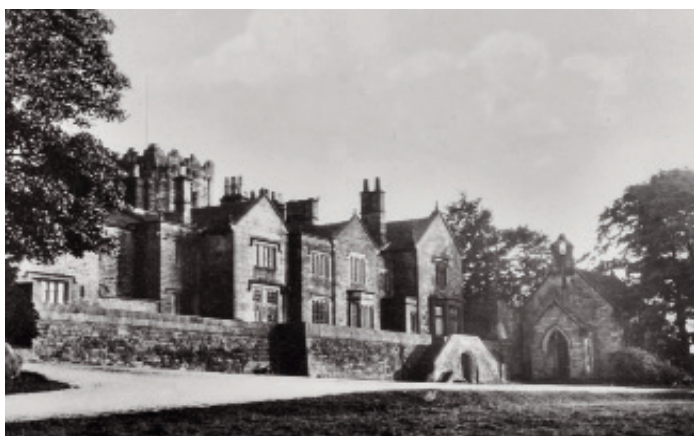
Longshaw House, West Front

Canning was a Tory to the more progressive side of the party, leading a faction known as Canningites. Lord Kenyon was described as an ultra-Tory in a group courting the Duke of Wellington, and possibly the Duke of Rutland, in opposition within the party to Canning. They were clearly very well known to each other and I'd not be surprised if George Canning bought the plantation from Kenyon. Canning died in August 1827 and had relatively few assets. His widow was created Viscountess Kilbraham in January 1828, about the time Wellington became Prime Minister. It seems very likely that Lady Canning inherited the plantation, but she died in 1837. We