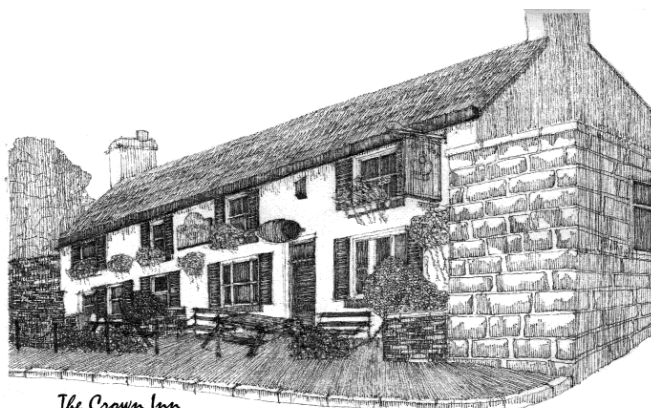
The Crown Inn