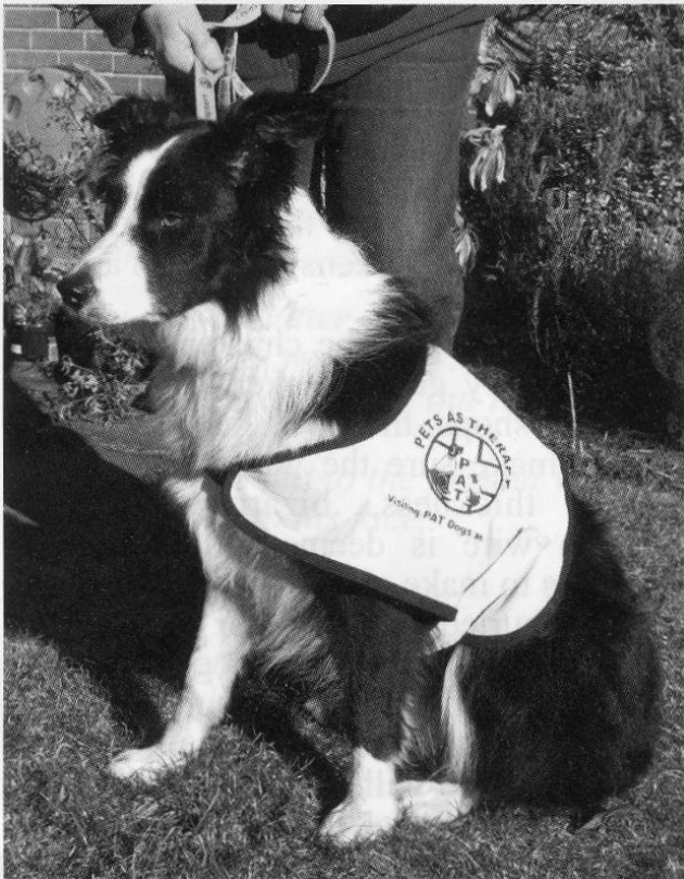
Local Dore PAT dog PIP