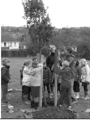
Totley Primary School and Totley All Saints School children having fun planting the new trees.

lesson in how to use a spade safely, by Tinsley Tree Project. They also learned how to mulch the trees to keep in the moisture.