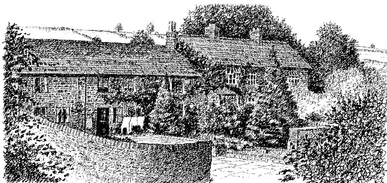
COTTAGES ON CORNER OF THE LANE TOTLEY BENTS BRUNNEDWARDS 1995

Cottages at Totley Bents have for the most part been extended, altered or knocked together over recent years. The two sketches show firstly the scene in 1975 and then the same view 20 years later. More about the history of the 'Bents' will appear in a later issue.