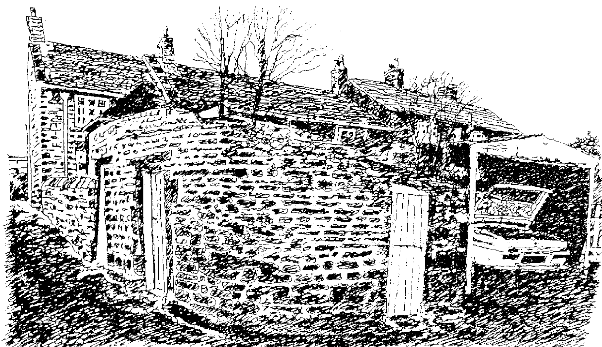
TOTLEY BENTS 1975 BRUNNEDWARDS 1975