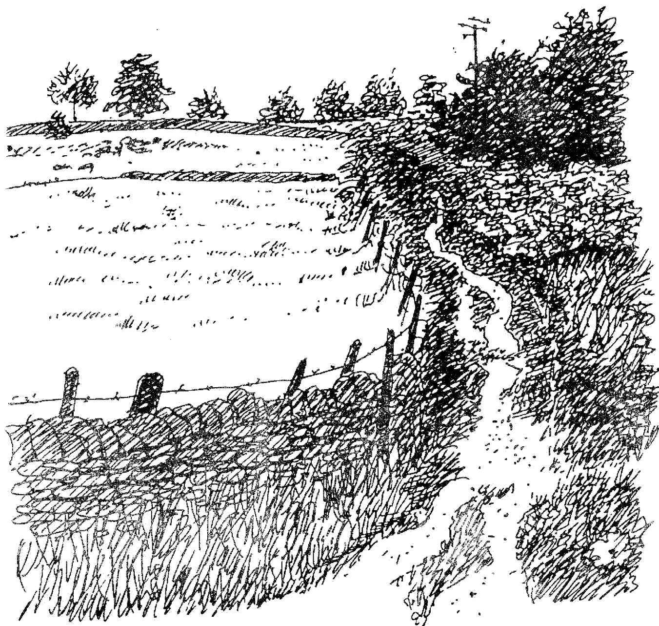
FOOTPATH UP FISHERS MOOR TOTLEY BRIAN EDWARDS 1995

The footpath from Strawberry Lee Lane leading to Shorts Lane descends down a footpath alongside Fishers Moor. To the left on the way down can be seen the upturned ground indicating the position of the old Ganister Pits. The "moor" was named after the Fisher family who lived nearby.