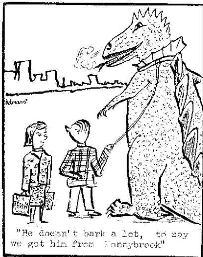
"He doesn't bark a lot, to say we got him from Mannybrook"