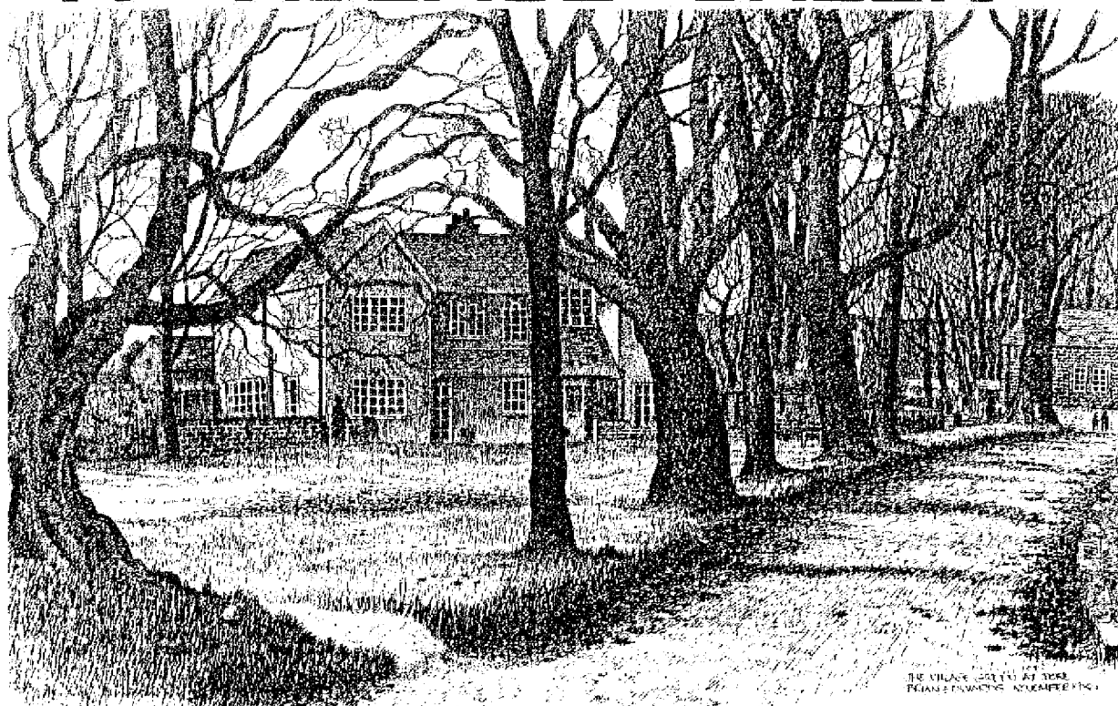
THE VILLAGE GREEN AT 1880 FROM AN OLD PHOTOGRAPH

VERY MUCH A part of an English scene is the Village Green. The one in Totley disappeared a long while ago but the one in Dore, pictured here, is still very much a going concern and during July the Annual Well Dressing took place.