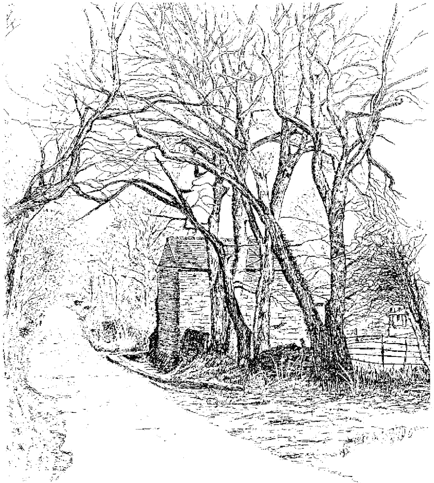
ARTISTS CORNER PENNY LANE

Join in all the fun of the Fayre and ladies; lots of ideas for your christmas present list, also plenty of games to play: Tombola, Bottle Hoopla, Roulette, Raffles, Handicrafts, Baby Bar, Cards, Wrapping Paper, Soft Toys, White Elephant and name a beautiful Baby Doll. Come and have a great afternoon out at St. John's Church Hall, Abbeydale Rd. South, 5th December at 2pm.